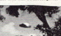
Feb. 7, 1966 Los Angeles Herald-Examiner A-11

The RAAF has taken the reports seriously enough to ask for clippings from the nests which will be examined, and any further flying saucer sightings from the area will be investigated.