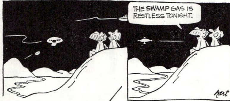
From B. C., the Post, May 9, 1966

"This is one of the primary reasons why the extra-terrestrials started making visitations in 1947, shortly after we developed this ability to watch over us and if possible to impart their advanced scientific, technological and sociological knowledge to help us re-