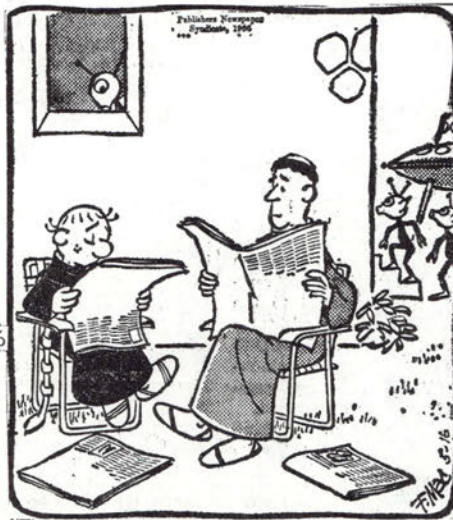
"These flying saucer stories are getting more ridiculous every day."