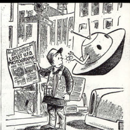
Wednesday, March 23, 1966