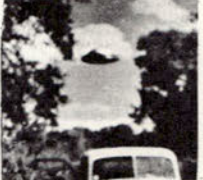
Another woman reported the object hovered over Hutton Sideroad in London for more than half an hour. She said it was a red light, high in the sky, around which a white ring seemed to spread out, then pull back, intermittently.

Thordale, a mother and her two children saw a white light, "quite high in the sky, that seemed to be blinking."